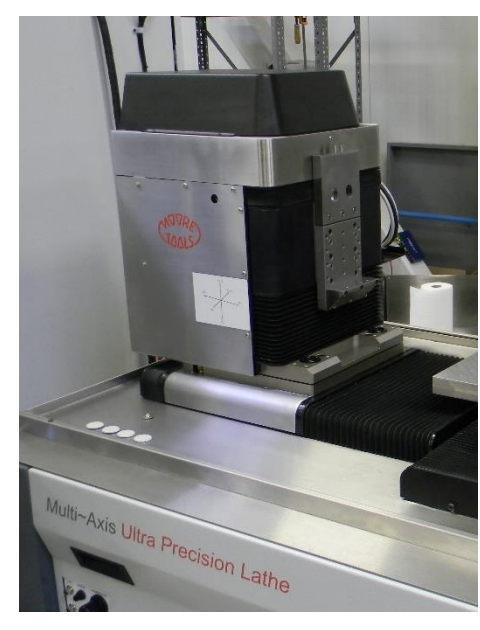
Y in Place of Spindle on 250UPL