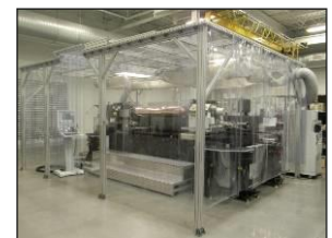
Turret Tooling & Temperature Controlled Air Shower Enclosure