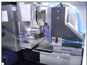
HD Vertical Grinding Spindle